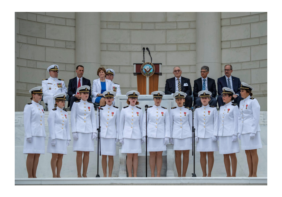
September 26, 2019